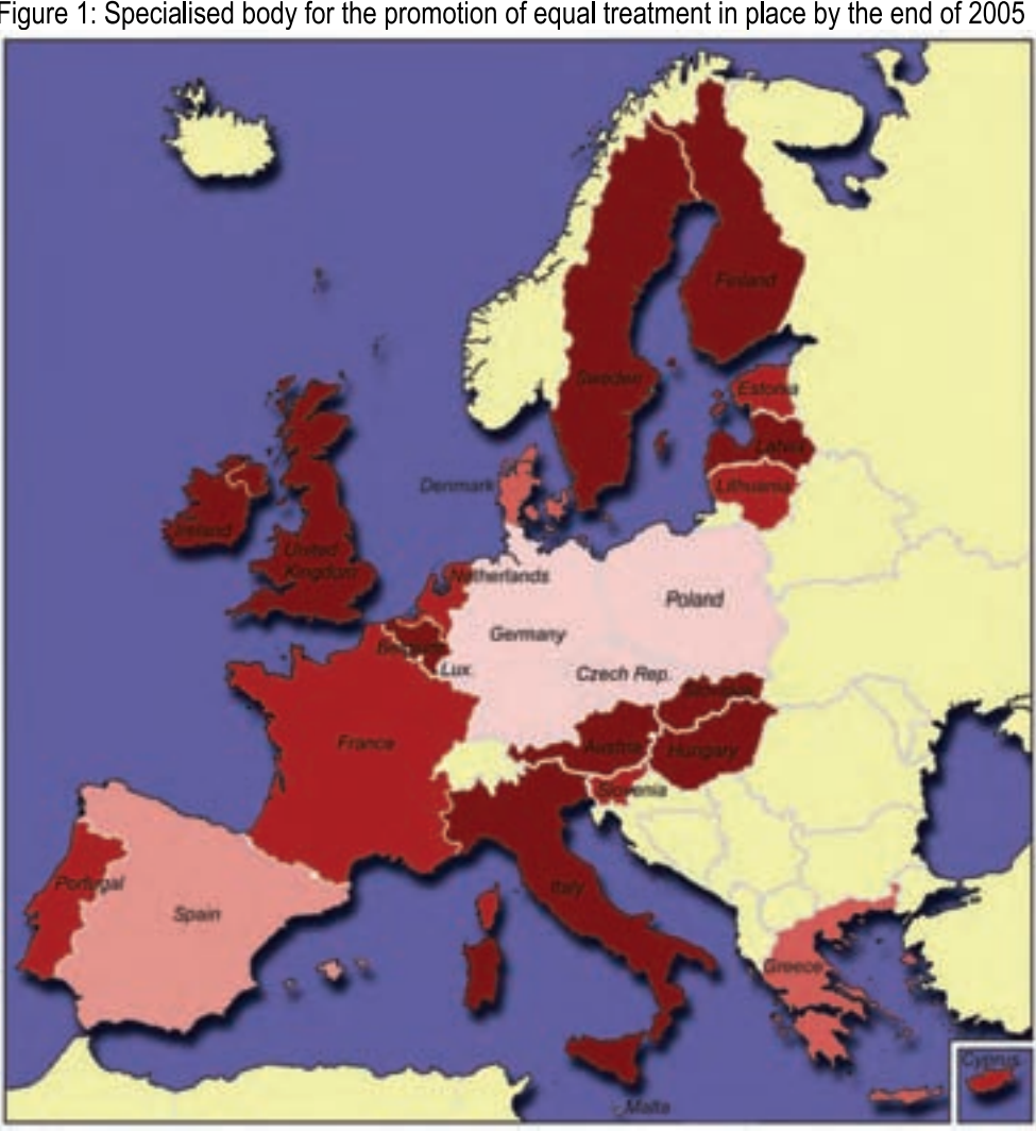
Figure 1: Specialised body for the promotion of equal treatment in place by the end of 2005